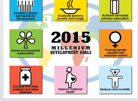
UN SUSTAINABLE DEVELOPMENT GOALS